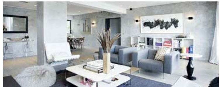
Po Shan Mansion