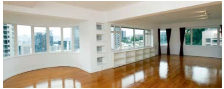
6A Bowen Road