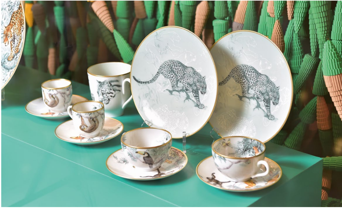
From top Hermès' carnets d'équateur porcelain collection depicts Robert Dallet's animal kingdom, set off perfectly against Daubisse's nature- inspired backdrop • Created with corrugated cardboard, the installations display a number of animals, such as this elephant

display, gazing out through a window that offers an opportunity for escape, while the drawing of a sky filled with clouds evokes the beneficial forces of time. Other imaginary animals with hidden anatomical forms – horns and claws – are found underneath a plant-like coat of fur made from corrugated cardboard inviting the audiences to picture themselves in.