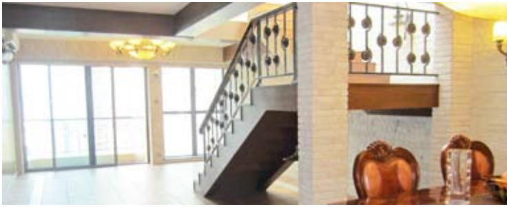
Haddon Court 西半山 海天閣 41C Conduit Road

Nicely decorated 3-bedroom apartment with direct access to private roof terrace