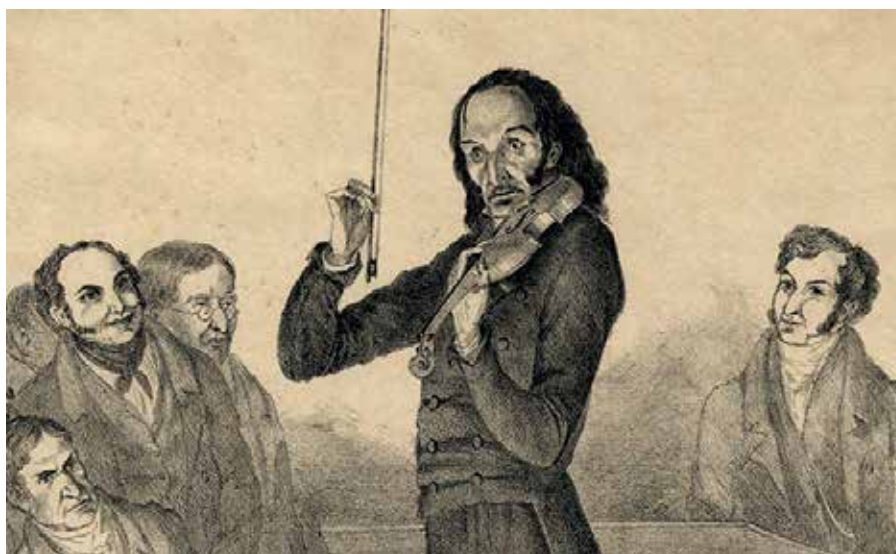
當年帕格尼尼音樂會的宣傳海報 The promotional posters for Paganini's concerts at the time.

讀者如對本期內容有任何疑問或查詢，歡迎電郵至 the_key@phongkong.com For any questions or inquiries, please email us on the_key@phongkong.com