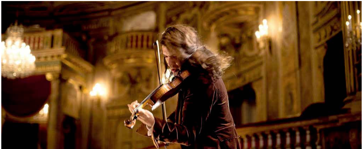
David Garrett 於電影中扮演帕格尼尼。是否太英俊了些？ Did David Garrett's portrayal of Paganini in the movie make him look too handsome?