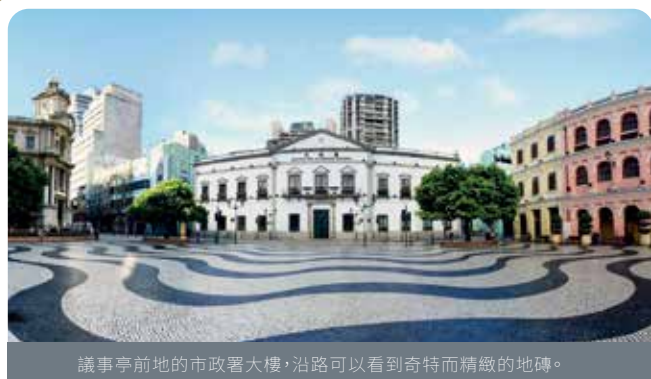
議事亭前地的市政署大樓，沿路可以看到奇特而精緻的地磚。