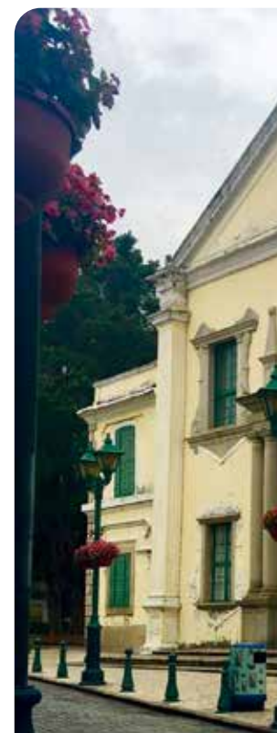
澳門教堂甚多。圖為澳門聖老楞佐堂。 家母於八歲時初到濠江，即於該教堂受洗。