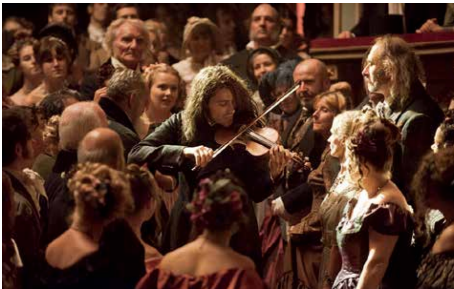
電影《魔鬼小提琴家》劇照 (The Devil's Violinist)